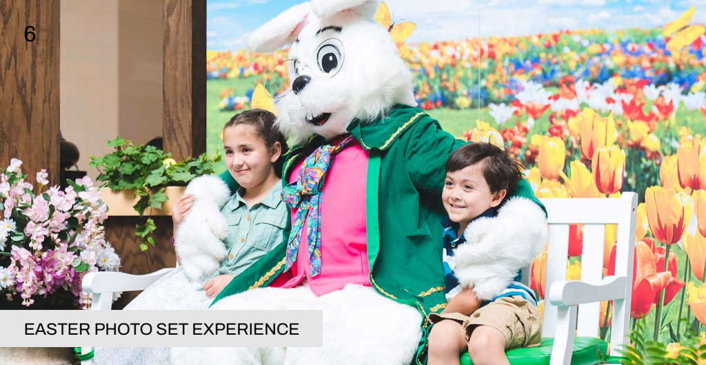
EASTER PHOTO SET EXPERIENCE