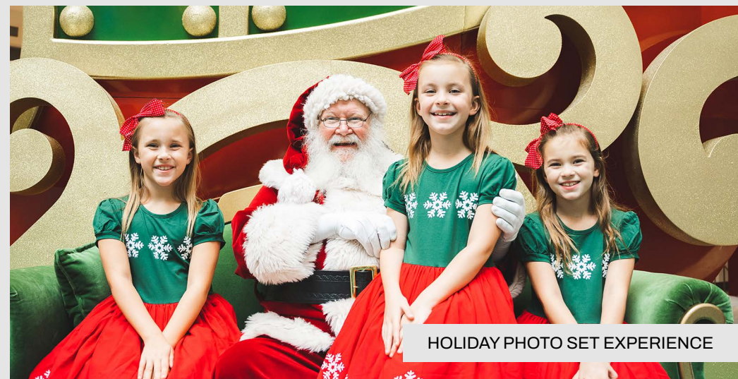
HOLIDAY PHOTO SET EXPERIENCE