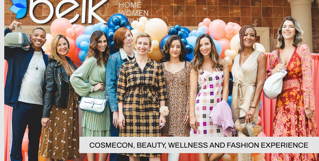
COSMECON, BEAUTY, WELLNESS AND FASHION EXPERIENCE